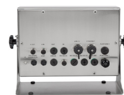
Easy access to communication interfaces